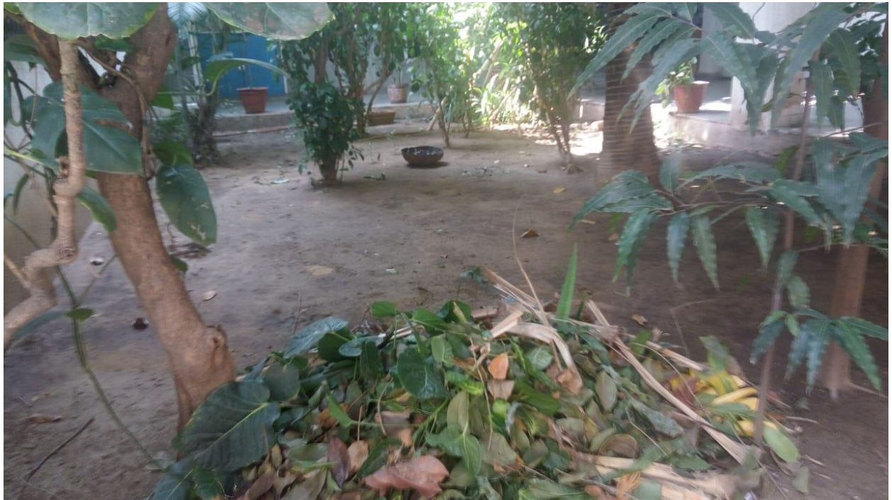
After cleaning the CERC campus