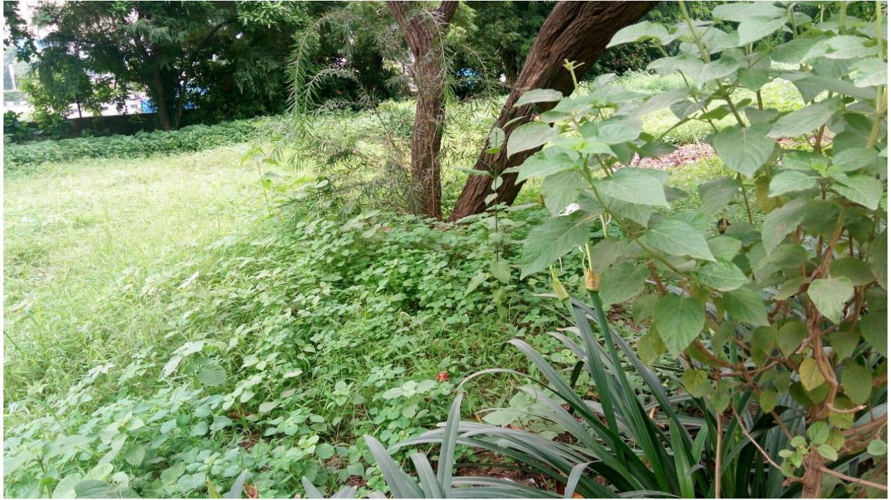
CERC's Green campus