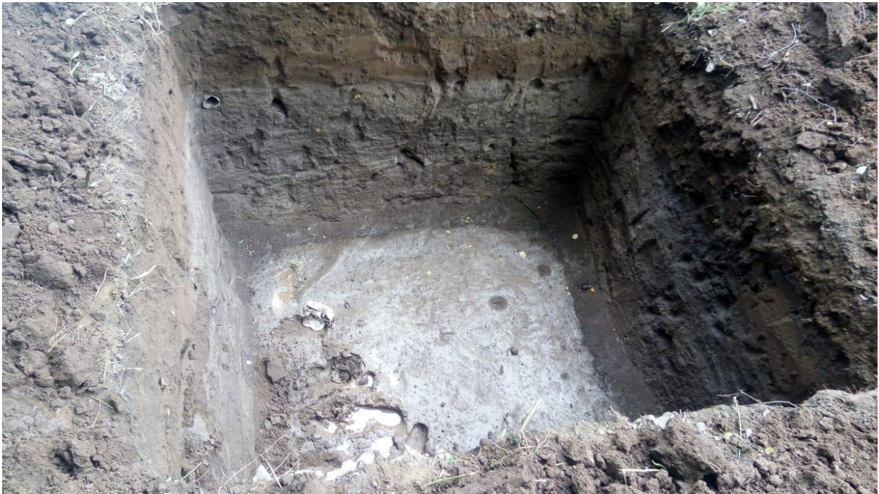
Excavate the compost pit size 6x6x6