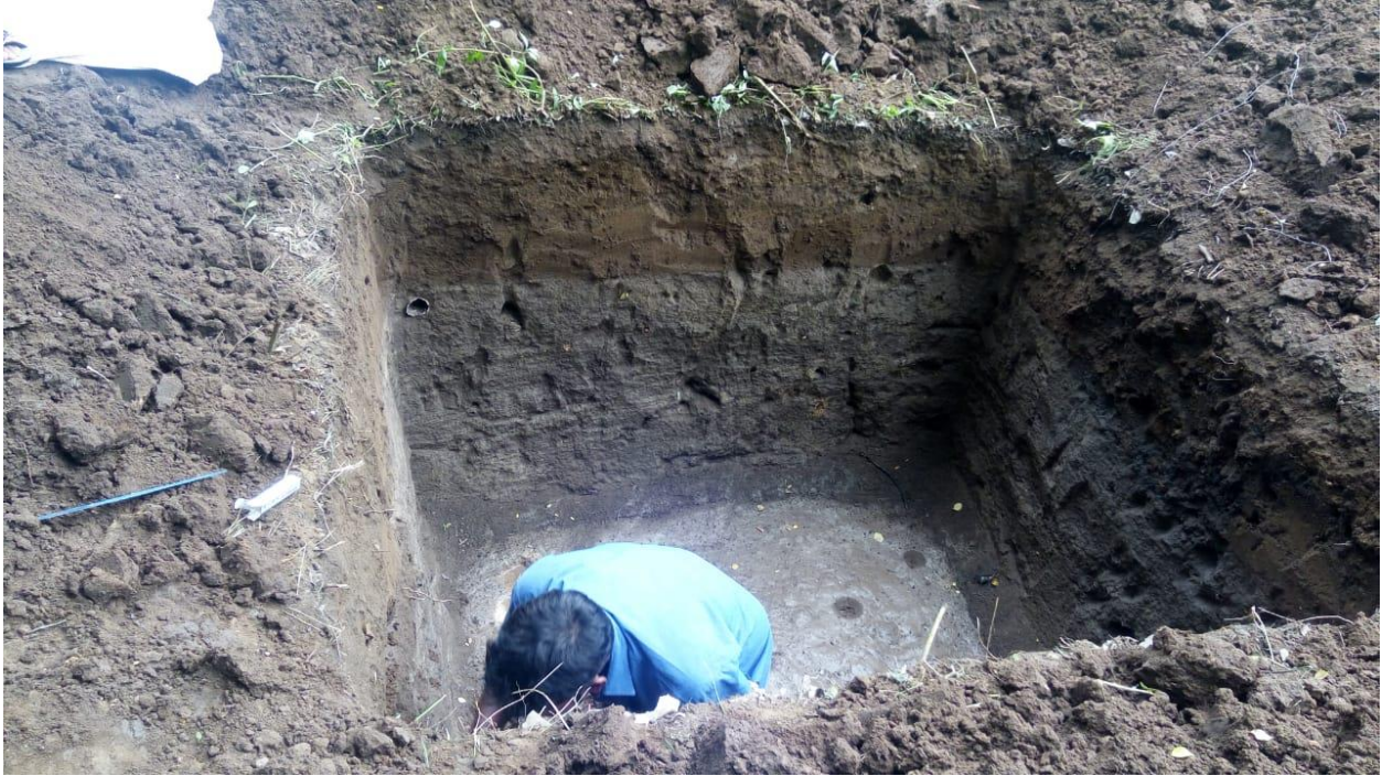
Digging the area of land in the corner of the garden for compost pit