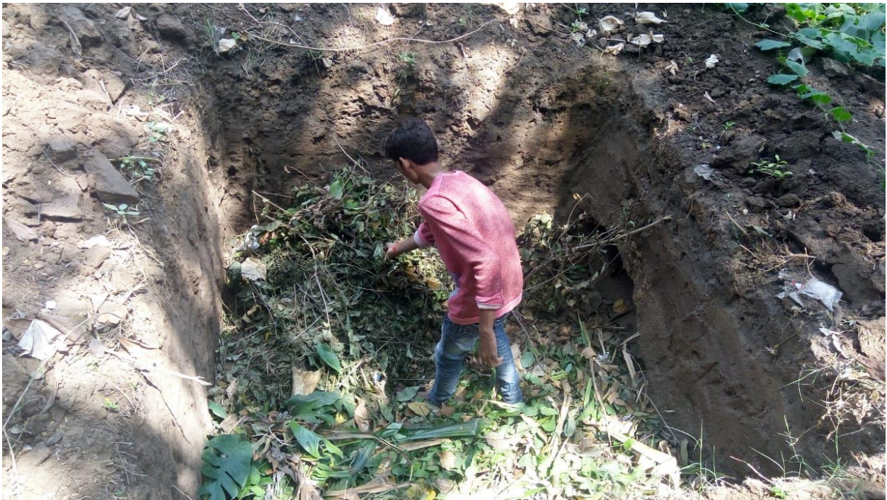
We drive roughly 90 percent of garden garbage to the compost pit for composting