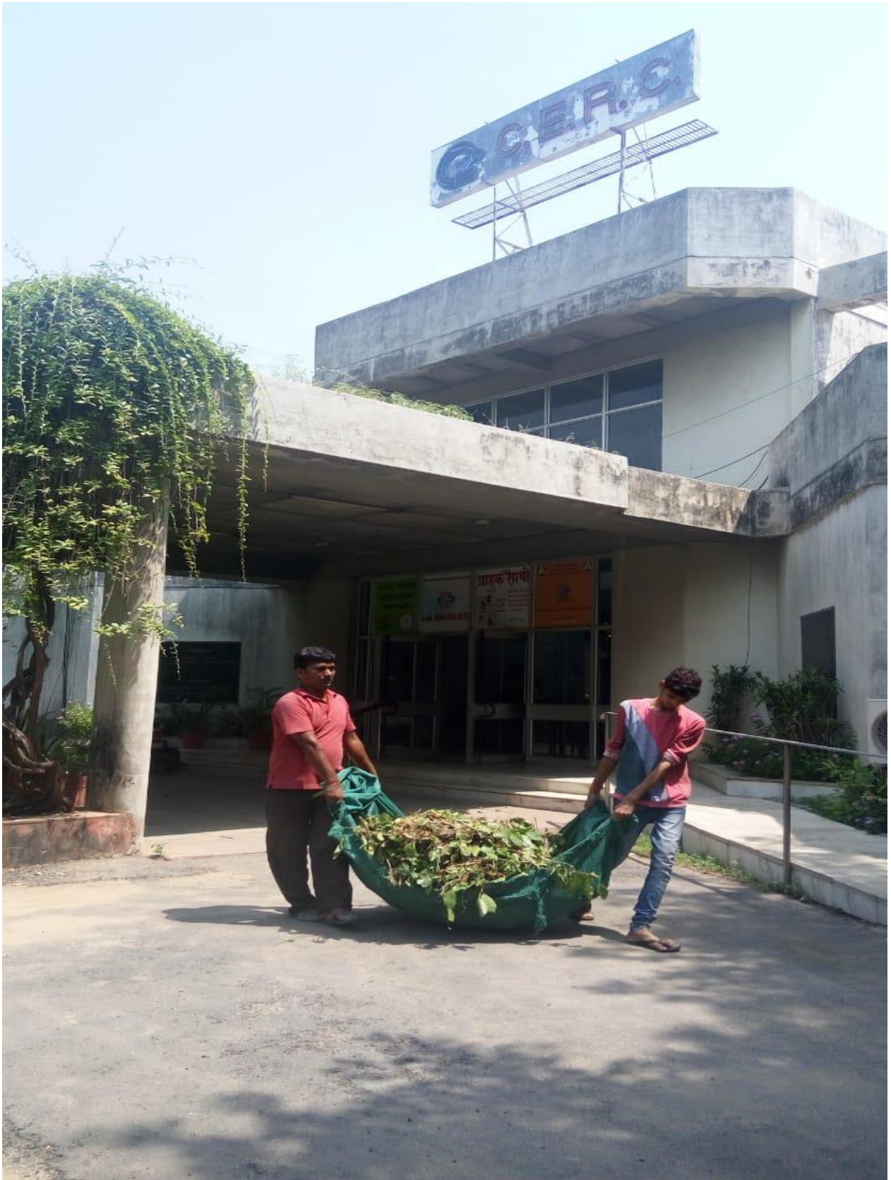
Compost Collection-leaf and other plant garbage to dump into the compost pit